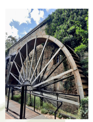
Social Surprise to Bridgewater Inn

Bookings are essential. Contact TBCC to secure your seat.