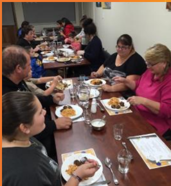
Kids cooked for their parents in the last C4C cooking class