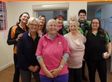
Volunteers keep us going!