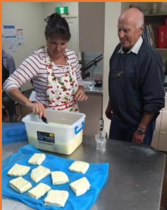
Cheese making was a great success! Find more info inside.